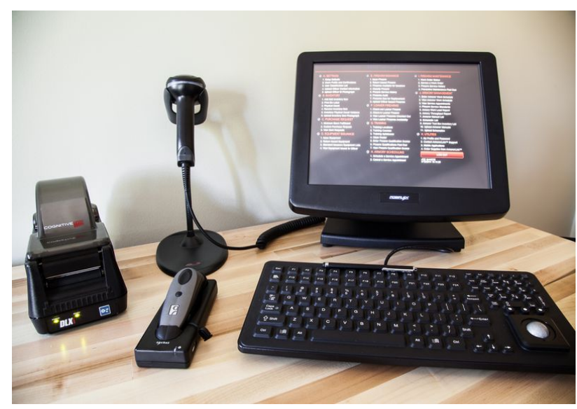
(Optional) ArmorerLink™ Technology Group

ArmorerLink™ Firearm Management Software (FMS) for the tracking, training and maintenance of firearms and equipment allows you to securely connect and collaborate with your entire agency from anywhere in the world using the Internet. ArmorerLink™ FMS includes offline applications, allowing users to utilize ArmorerLink™ FMS in areas where Wi-Fi, satellite or cellular connections are not available. Security is critical, and for this reason, we've partnered with Rackspace® to host the software and backup your encrypted data. To help ease the transition of implementing and sustaining ArmorerLink™ FMS at your agency, we offer built-in training video tutorials for the entire application, as well as 24/7/365 world-class technical support. If you wish, we also offer optional software training at our corporate office in Hillsboro, Oregon, United States.